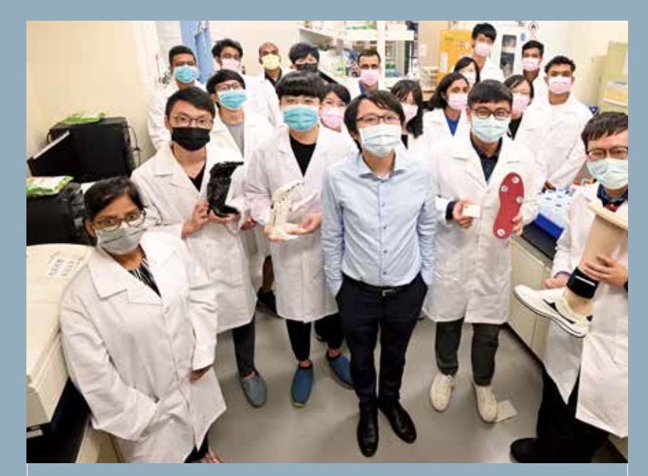
A research team led by Professor Lin Zong-hong (center) of the Institute of Biomedical Engineering has developed a self-powered system suited for use in medical and environmental monitoring.

Existing automatic monitoring systems use sophisticated components, making them quite expensive. By contrast, since Lin's sensing system converts mechanical energy such as small vibrations into electrical signals that can be analyzed by the Internet of Things, it can be made of low-cost components; it's production cost is further reduced by its simple design and the wide